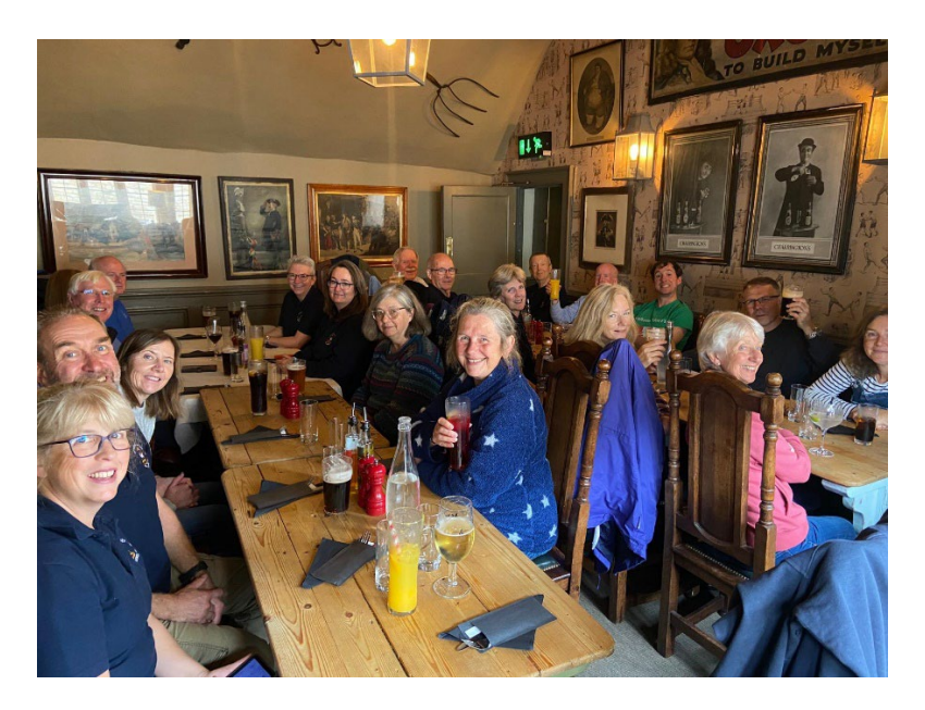
Summer outing lunch at The Tobie Norris in Stamford

Over 20 people joined in the day from various Towers within the branch which allowed for a good chance to catch up with friends or introduce ourselves to new ringers. We managed to avoid too many people banging their heads in stairwells and although we sadly missed seeing any Peregrines at Stamford All Saints we did get showered with various types of bird-related debris, no injuries but quite some amusement! Towards the end of the day, we had time for a stop at the lovely Brasserie in Uppingham for a much-appreciated cuppa and slice of cake before our last ring of the day.